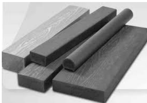
Figure 9: Plastic Lumber

Porous Paving - This material can be used for driveways, walks, or patios. It allows water to pass through to the soil, while providing a solid surface for human and vehicular traffic.