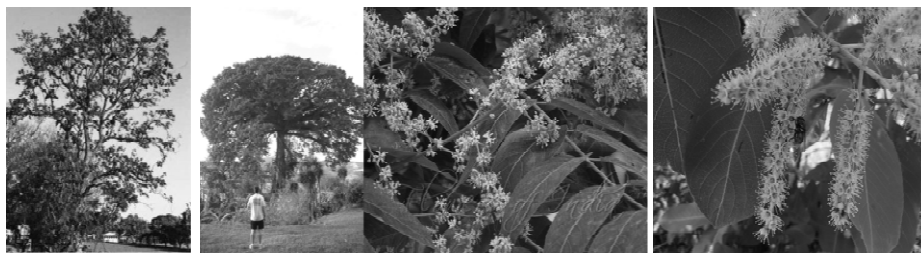
Figure 7: Species with Open Branching System – Bombax, Ceiba, Reetha, Terminalia