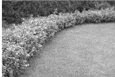
Figure 3: Ground Cover Area