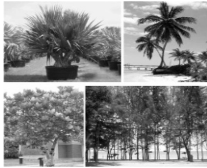
Figure 5: Wind Breaking Trees