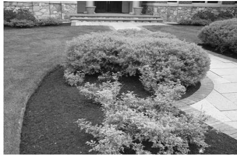
Figure 2: Mulched Bed Next to Lawns or Other Ground Covers