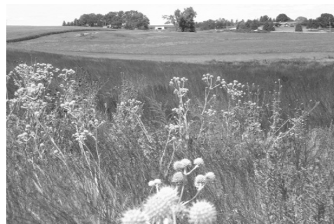
Figure 1: A High Maintenance Lawn Next to a Low Maintenance Shrub Bed, Woods, or Prairie

Do separate areas that require different maintenance levels