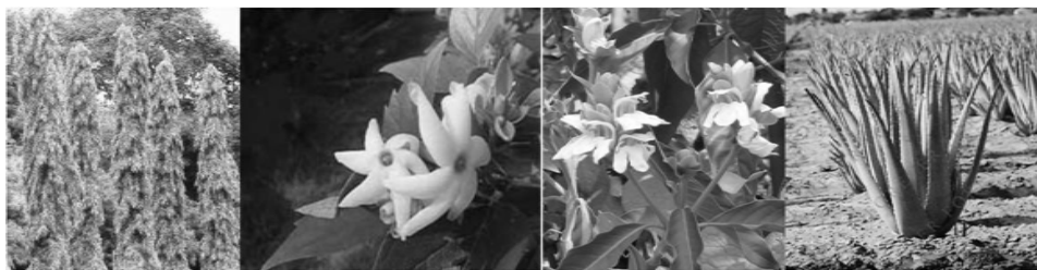
Figure 4: Tree Varieties – Ashok, Parijat, Adulsa, Aloe